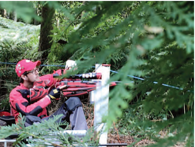
The courses were long and challenging, set in beautiful (if not a little muddy) surroundings.

bunch of fairly well known names from overseas, but what a pleasure it was to see Castle's own Red